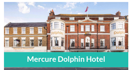
Mercure Dolphin Hotel