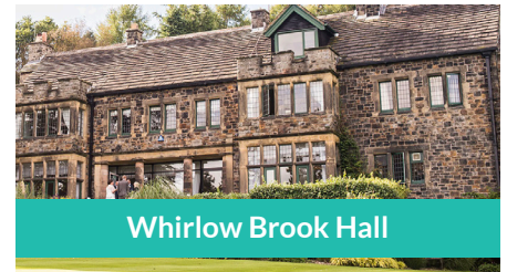
Whirlow Brook Hall