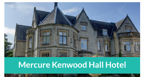
Mercure Kenwood Hall Hotel